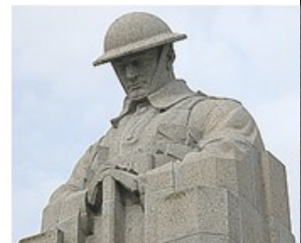
Canadian St. Julien Memorial near Ypres/ Ieper, Belgium

In lieu of Remembrance Day on Sunday, November 11, the Smoky Lake County Office and Public Works will be CLOSED on Monday, November 12