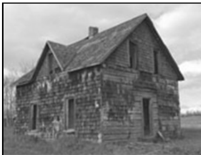
Photo: Municipally Designated Site, Anderson House located at Lobstick Settlement on Victoria Trail.