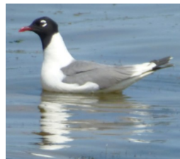
Black headed gull

See the Smoky Lake County website "Parks & Recreation" or Alberta's Lakeland ( www.albertaslakeland.ca ) for location maps and information on the facilities located at most of the sites.