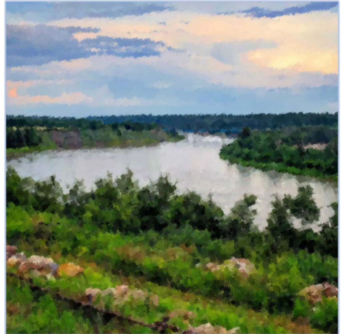
Looking east on the North Sask. River, at 'the Elbow'