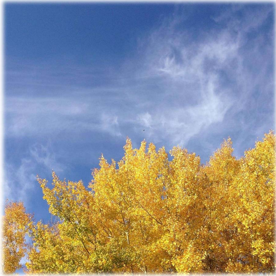
Hillside Acres in Fall