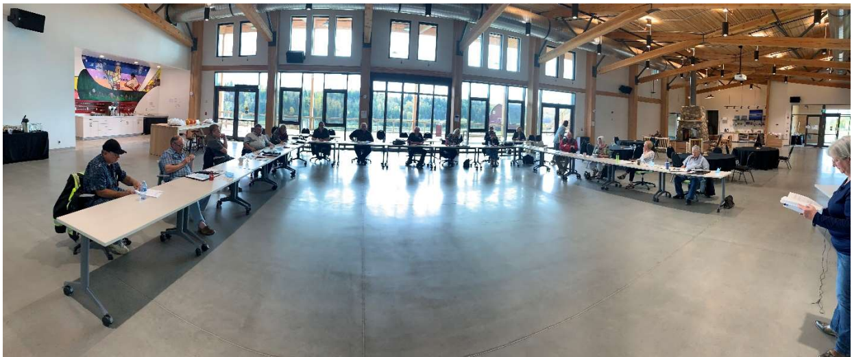
(Photo taken on September 21, 2020 at the Cultural Gathering Centre, Métis Crossing. Photo Credit: Adam Kozakiewicz, CAO, Town of Smoky Lake)