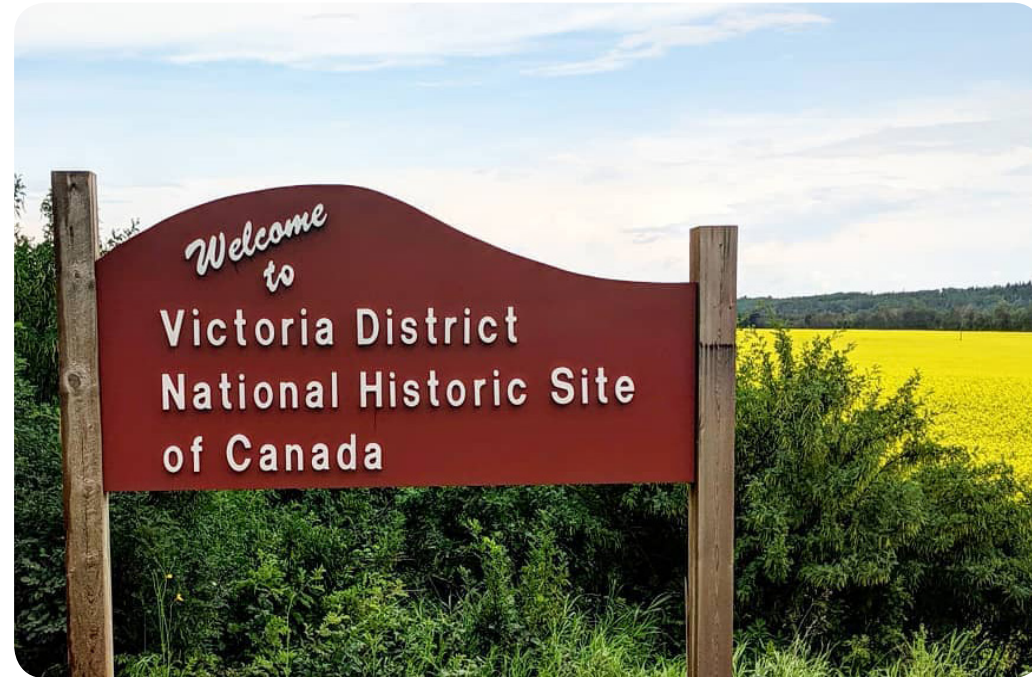
Located at west boundary of Victoria District

Victoria Home Guard Historical Society P.O. Box 28 Warspite, AB T0A 3N0