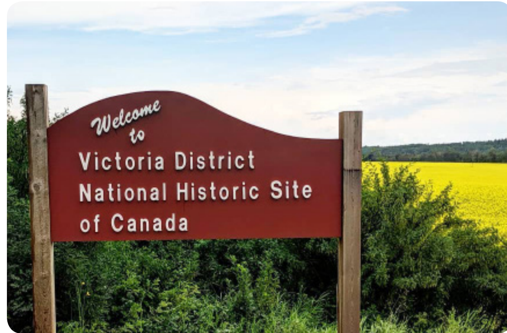
Located at west boundary of Victoria District

Victoria Home Guard Historical Society P.O. Box 28 Warspite, AB T0A 3N0