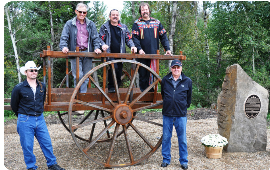
Dedication of Red River Cart Monument